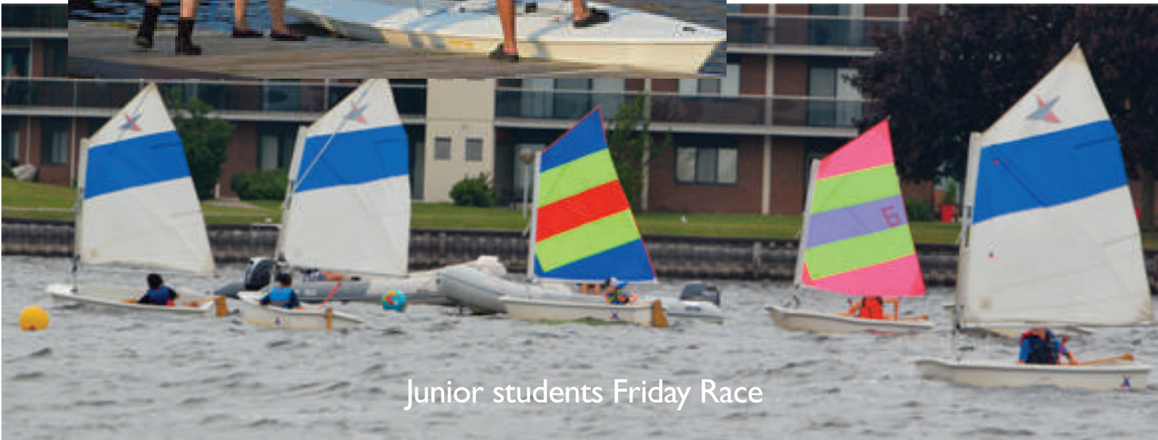
Junior students Friday Race